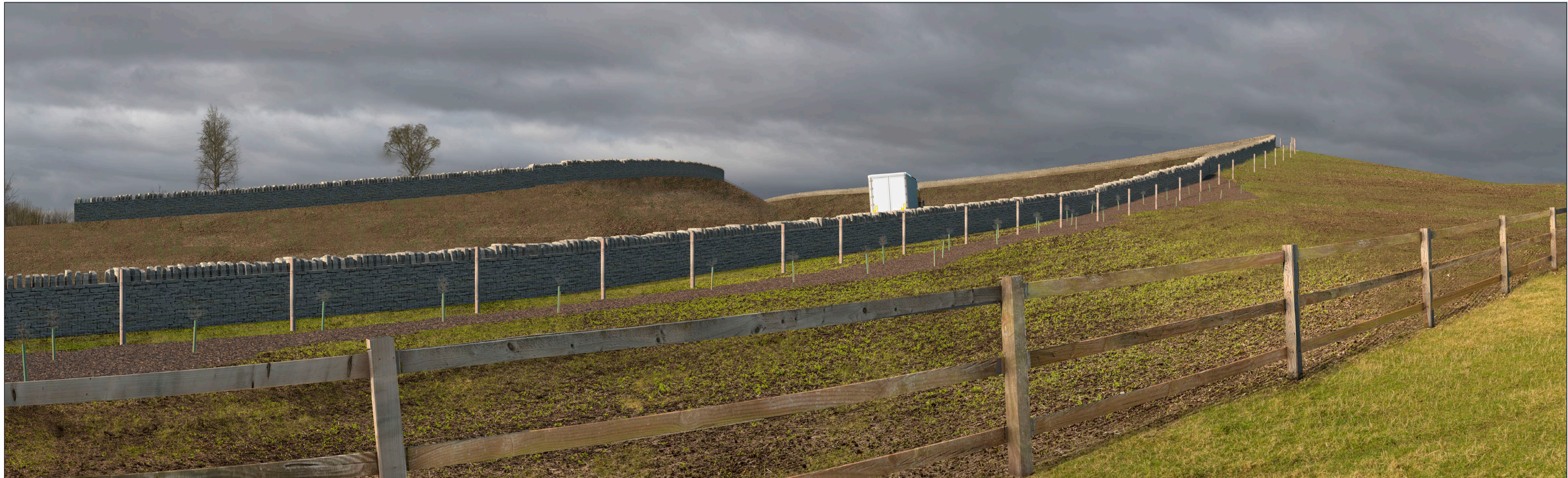
Operation year 1 winter photomontage