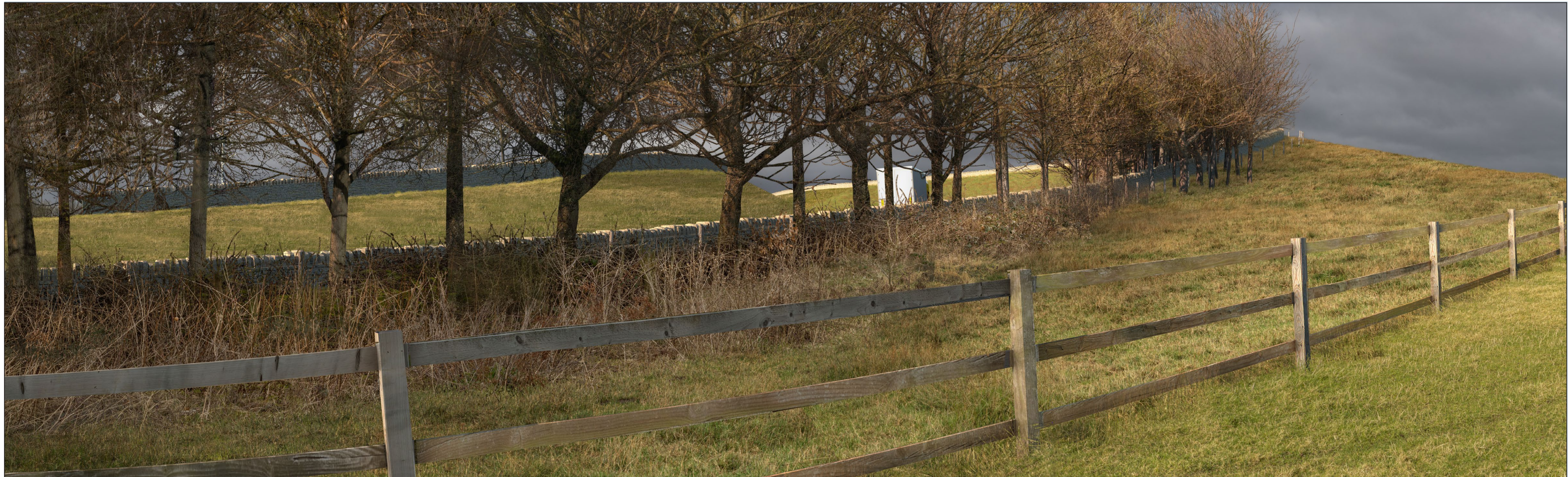
Operation year 15 winter photomontage