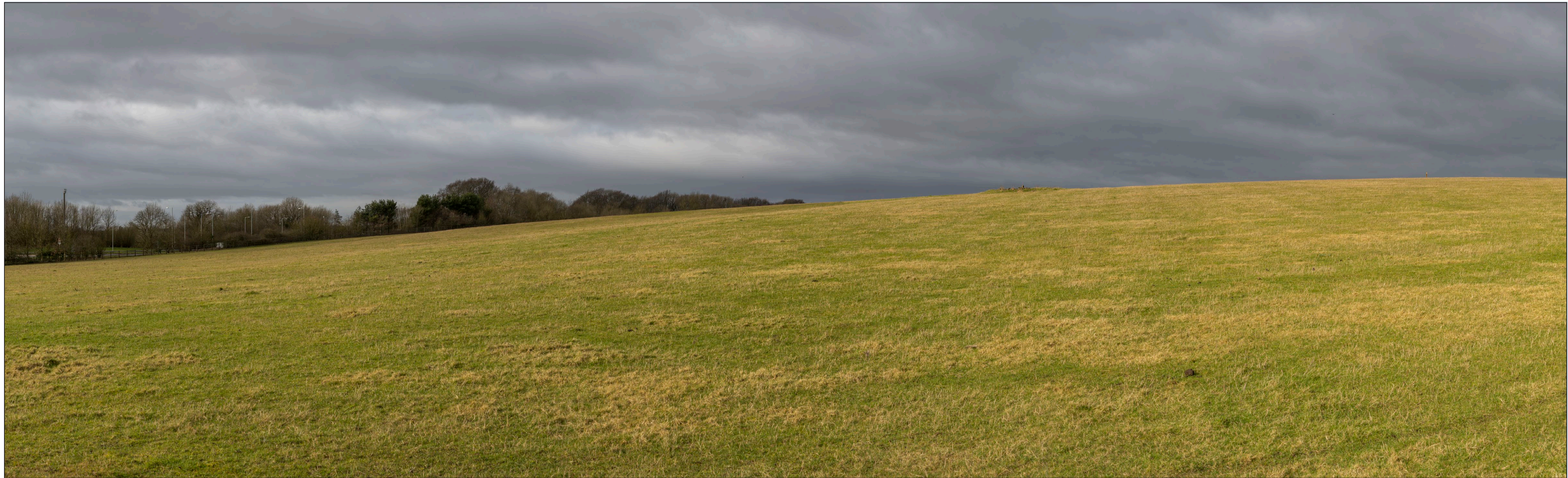
Winter baseline photograph