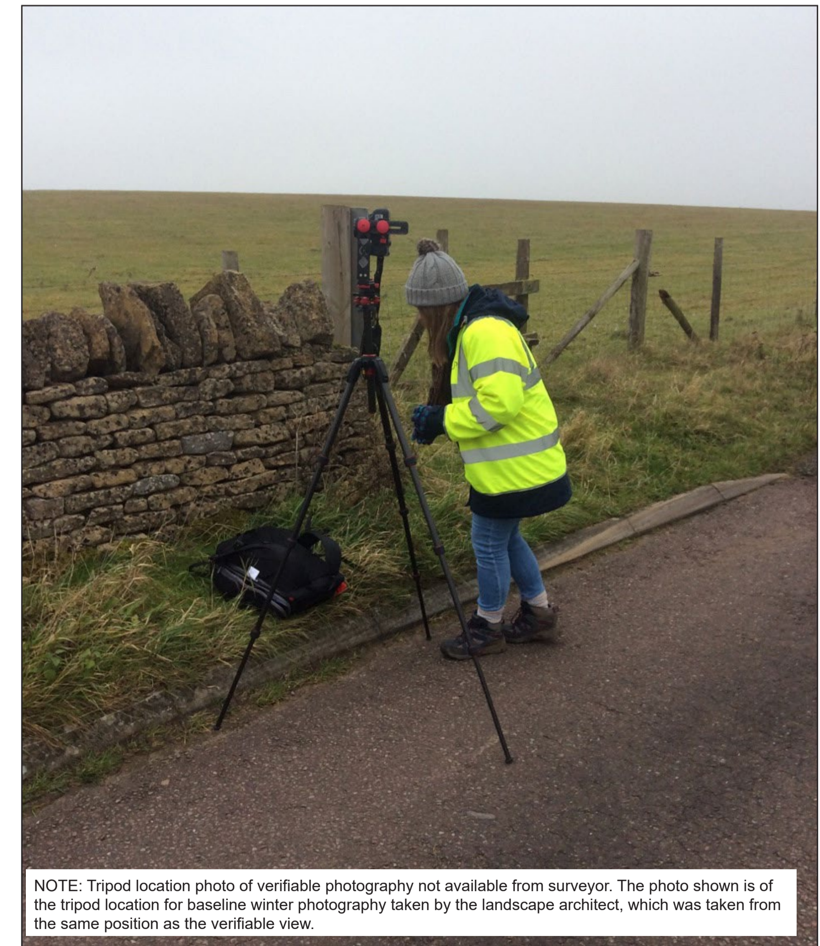
NOTE: Tripod location photo of verifiable photography not available from surveyor. The photo shown is of the tripod location for baseline winter photography taken by the landscape architect, which was taken from the same position as the verifiable view.